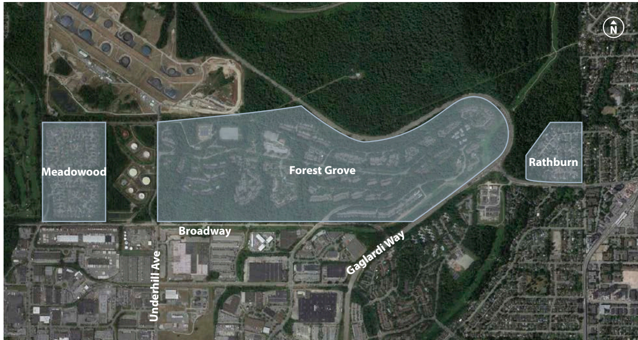
Postcard notification area for Forest Grove, Meadowood Park and Rathburn neighbourhoods.

In addition, TransLink sent email notifications to 64 Forest Grove residents who signed up for project updates. The emails provided information about upcoming meetings and other engagement opportunities.