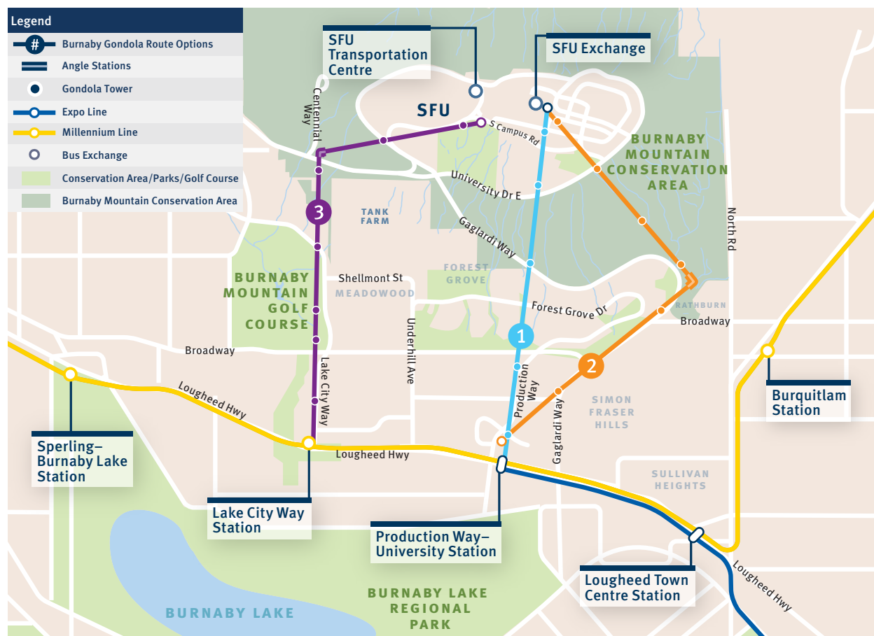
Proposed gondola routes.

Route 3 is the western route from Lake City Way SkyTrain Station to SFU Burnaby campus, which would cross the Burnaby Mountain Golf Course, changing direction at a non-boarding angle station, and continuing to SFU Burnaby Campus with the terminal located south of South Campus Road. The route length is 3.6 km and estimated travel time is 10 minutes.