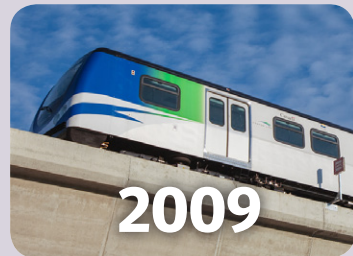
CANADA LINE OPENS