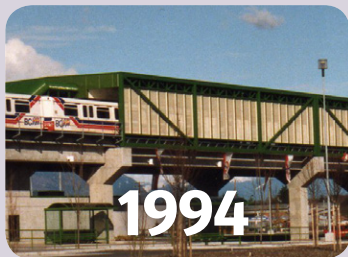
EXPO LINE SURREY EXTENSION OPENS