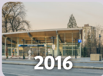
EVERGREEN EXTENSION OPENS