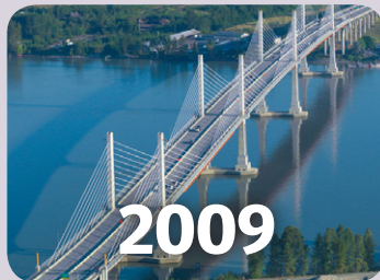
GOLDEN EARS BRIDGE OPENS