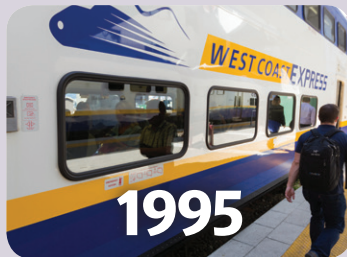
WEST COAST EXPRESS OPENS