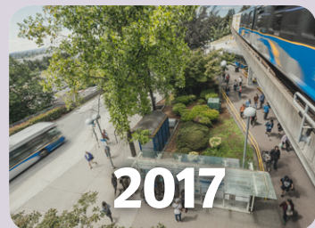
ROLL-OUT OF 10 YEAR VISION BEGINS

Over the past 30 years, improvements to transit, roads, and walking and cycling have supported the efficient and sustainable movement of people and goods.