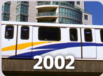
MILLENNIUM LINE OPENS