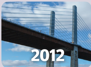
NEW PORT MANN BRIDGE / HIGHWAY 1 OPENS